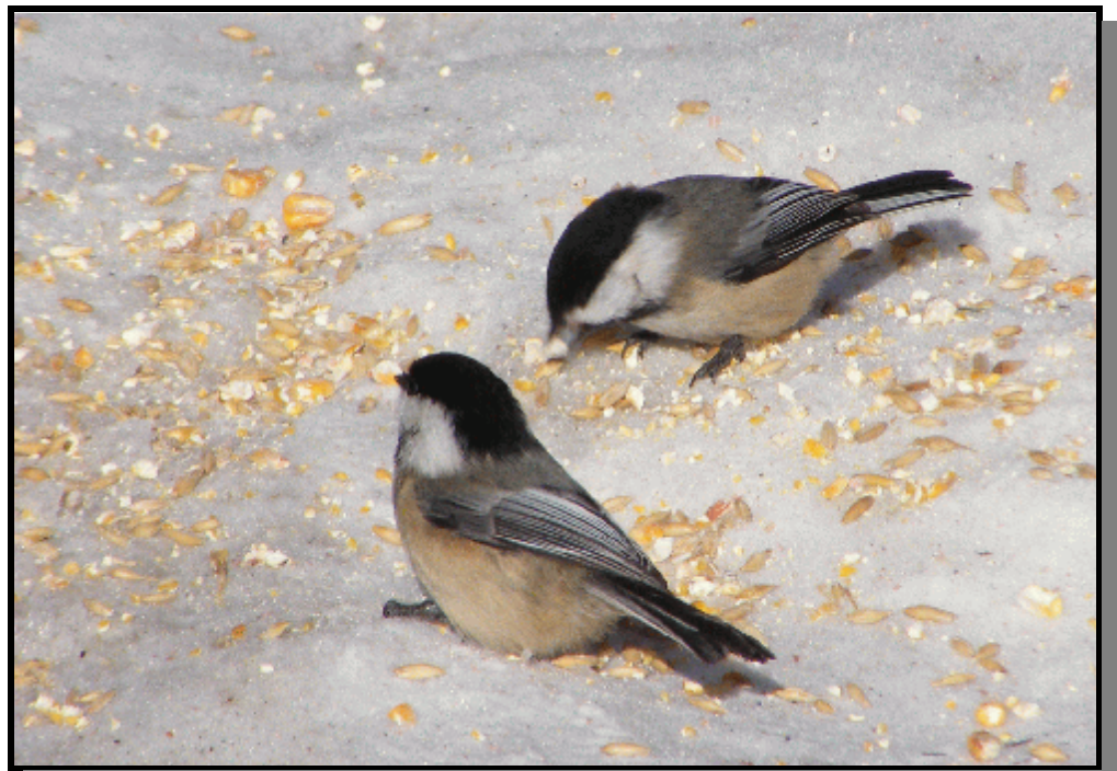
Chickadees in the back yard feasting on cracked corn, and McCharles Lake