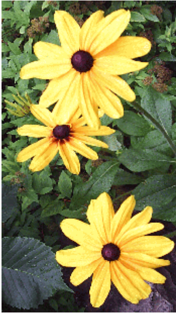
Rudbeckia hirta ( Black-eyed Susan )