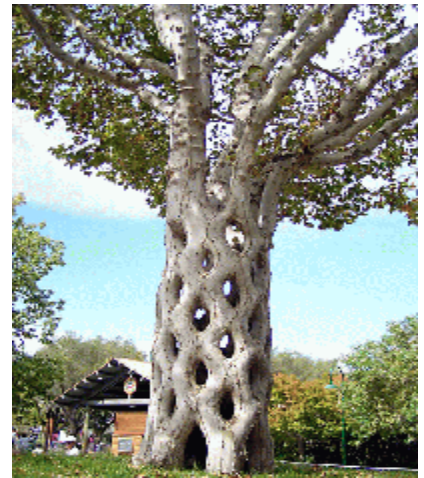
"You have to train them young!"

Open 7 days a week starting in May. "From Our Garden to Yours"