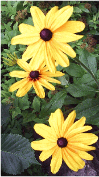
Rudbeckia hirta ( Black-eyed Susan )